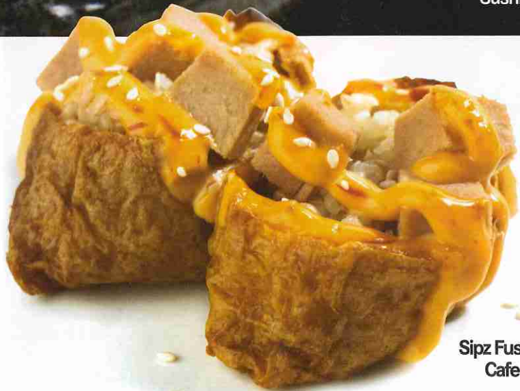
Sipz Fusion Cafe