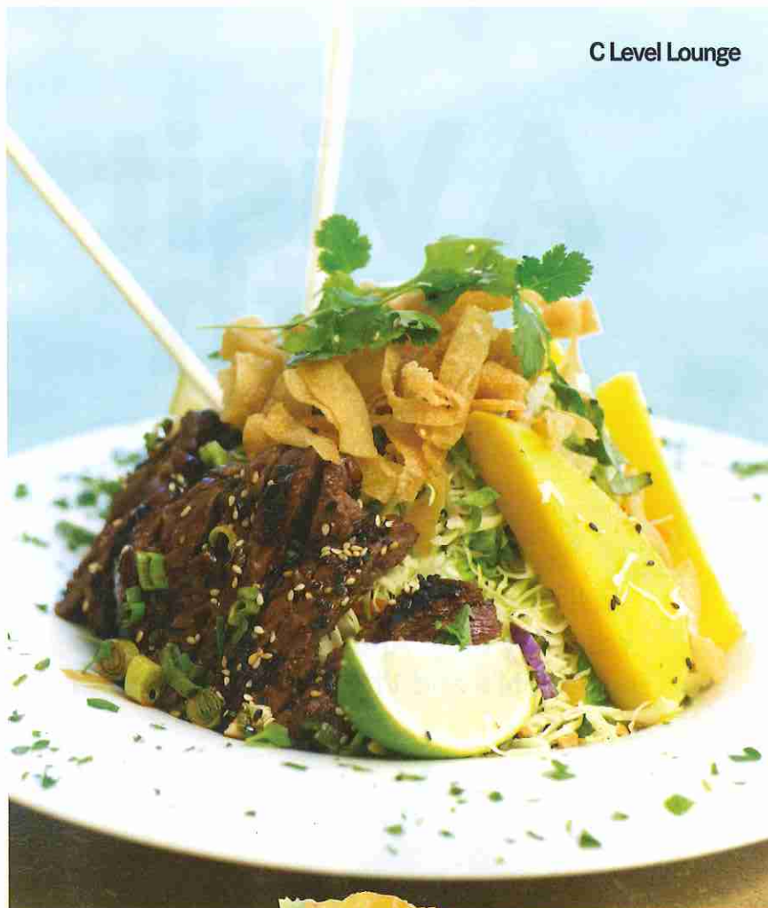
C Level Lounge